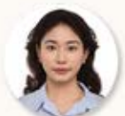
TO HAI GIANG